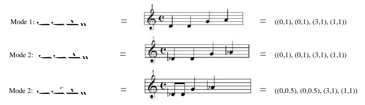
Figure 2. Variations of a motive in Modes 1 and 2 with D<sup>4</sup> serving as a melodic basis.

The Signature File indexing schemes have a simple structure and require significantly less storage overhead. In Figure 3 is presented the structure of a signature indexing scheme, as